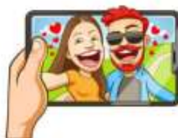
A Parent's Guide to Sharing Pictures