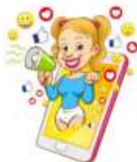
A Parent's Guide to Online Influencers