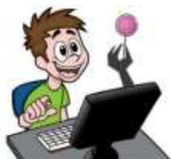
A Parent's Guide to Online Grooming