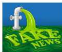
A Parent's Guide to Fake News