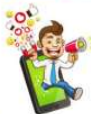
A Parent's Guide to Live Streaming