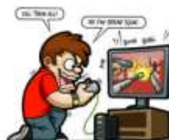
A Parent's Guide to Gaming